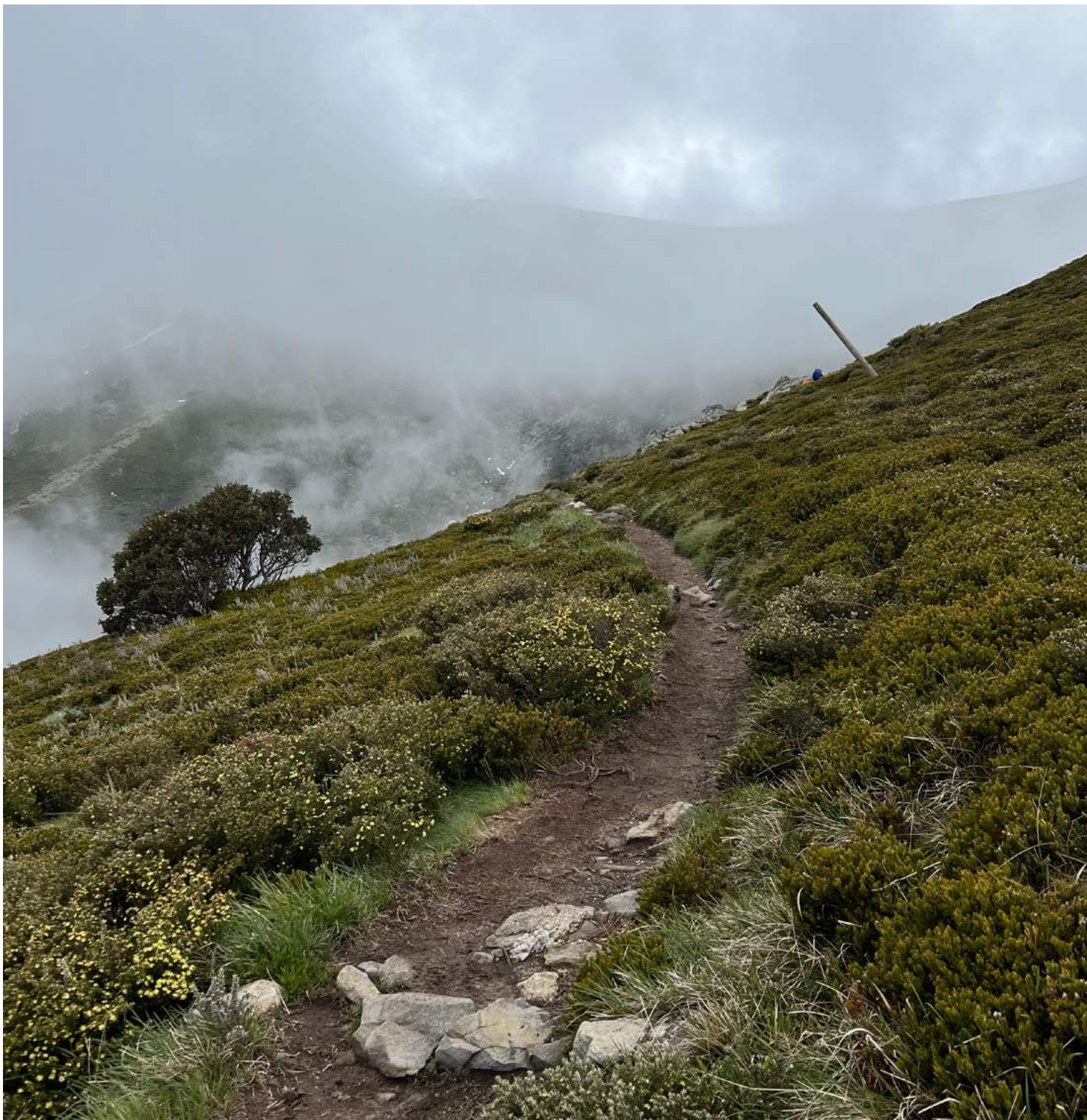
IT WAS A LONG UPWARD JOURNEY INTO THE COSMIC MIST.